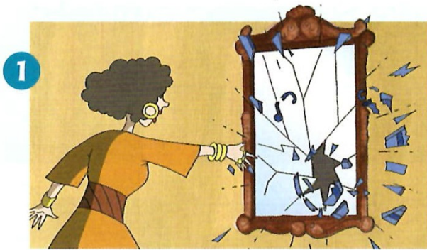
1 The queen is bored.

1. Look, read and circle True (✓) or False (✗).