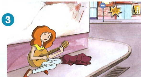
3 Snow White is nervous.