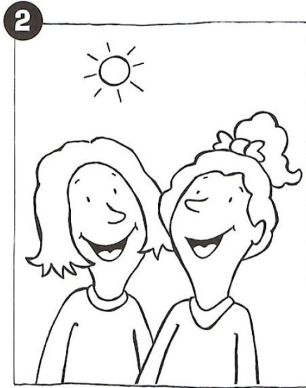
Scarlett and Amelia