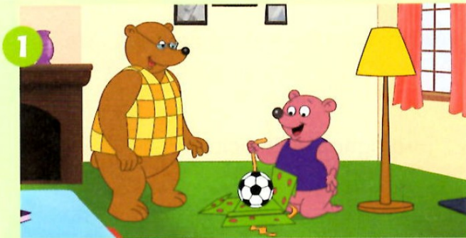
1 Joe gets a great present from his dad.

1. Look, read and circle True (✓) or False (✗).